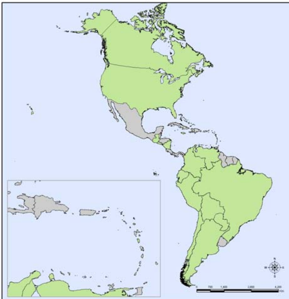
Map 3. Pandemic (H1N1) 2009, Intensity of Acute Respiratory Disease in the Population. Americas Region. EW 48*.

Intensity of acute respiratory disease □ No information available □ Low or moderate □ High □ Very high