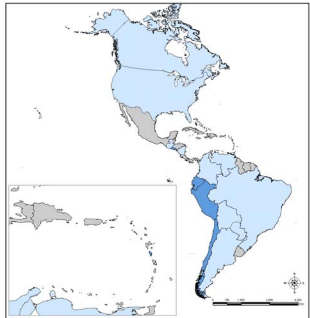
Map 2. Pandemic (H1N1) 2009, Trend of respiratory disease activity compared to the previous week. Americas Region. EW 48*.

Trend □ No information available □ Decreasing □ Unchanged □ Increasing