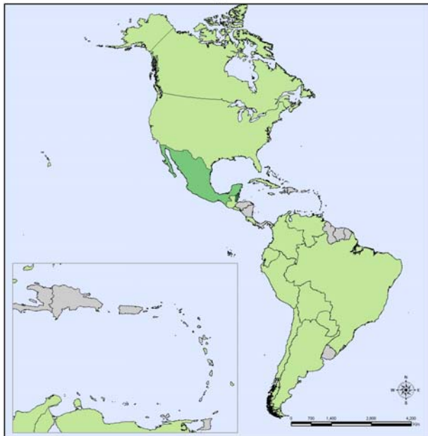
Map 3. Pandemic (H1N1) 2009, Intensity of Acute Respiratory Disease in the Population. Americas Region. EW 49*.

Intensity of acute respiratory disease □ No information available □ Low or moderate □ High □ Very high